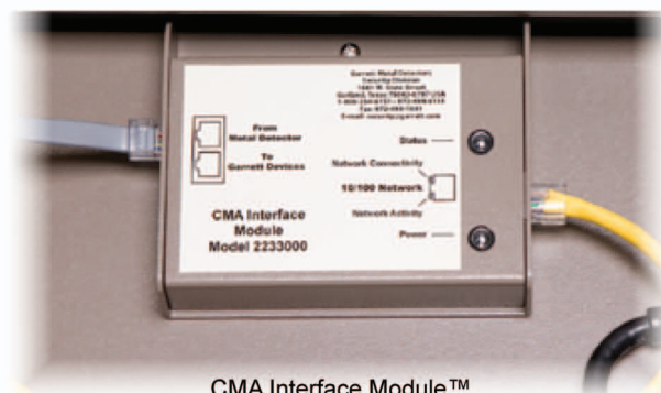
CMA Interface Module™

Real-time network access to your metal detector with Garrett's CMA Module – now with group management capabilities.