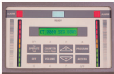
▲ The Garrett MT 5500 walk-through offers multi-dimensional scanning and versatile programming options.